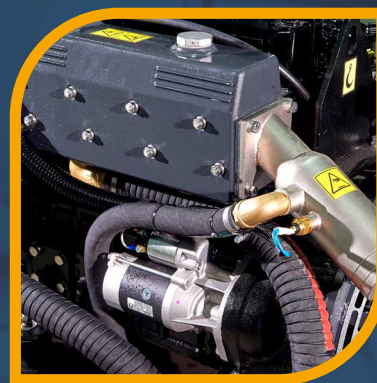
Gas and water exhaust

We offer now what others will do tomorrow.