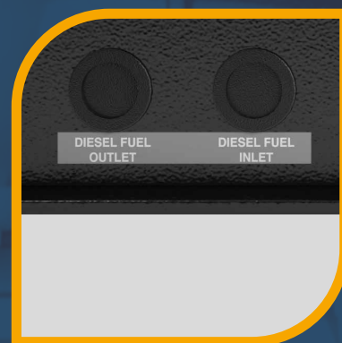
Input/Output fuel pipe

We offer now what others will do tomorrow.