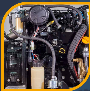
1500 rpm Yanmar engine