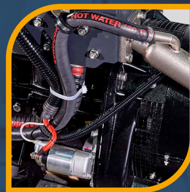
Gas and water exhaust

We offer now what others will do tomorrow.