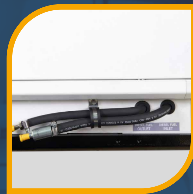
Input/Output fuel pipe

We offer now what others will do tomorrow.