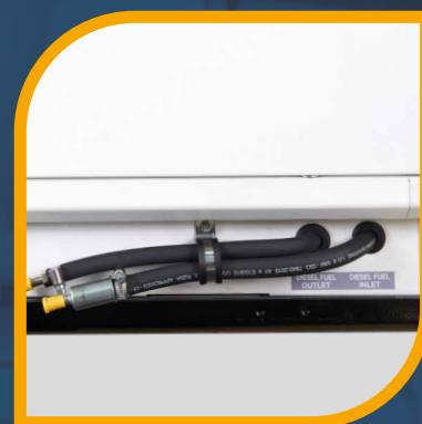
Input/Output fuel pipe

We offer now what others will do tomorrow.