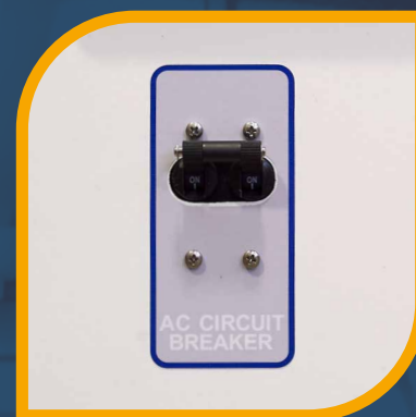
Main circuit breaker

We offer now what others will do tomorrow.